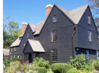
House of 7 Gables