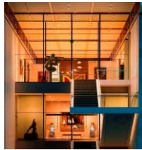
MFA New Wing

Monday, October 24th & Tuesday, October 25th